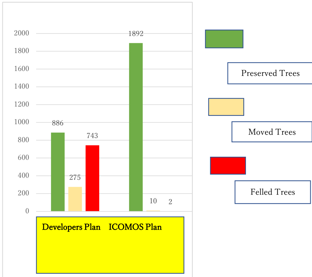
Fig. 3 - Comparison of Number of Trees (Preserved/Moved/Felled) between Developer's Plan and ICOMOS Plan