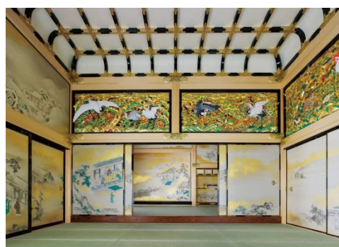
Interior of Honmaru Palace in Nagoya Castle

The detail of the post-conference excursion will be announced by the 3 rd Circular on 1 June. Those who want to participant in the excursion will be requested to register and pay the travel expense by the middle of August.