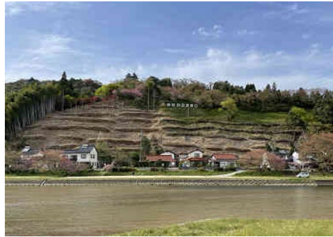
Site of Mitoya Fortress