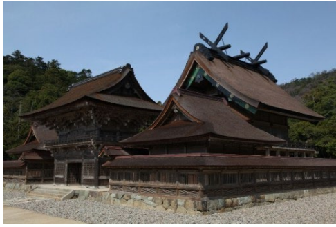
Izumo Great Shrine