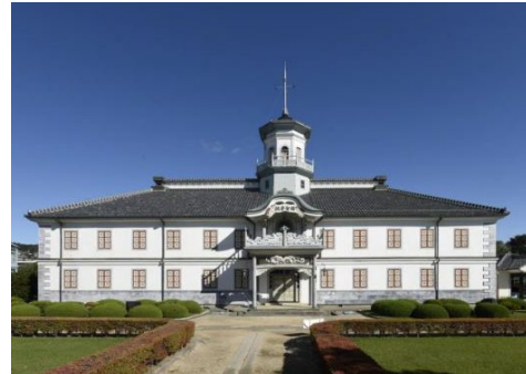
Kaichi School (Matsumoto)