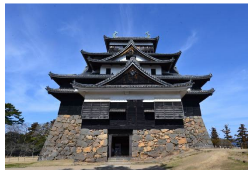
Matsue Castle, Tenshu