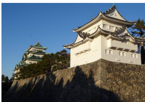
South-western Tower of Nagoya Castle