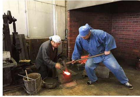
Performance of Japanese sword making in Oku-Izumo