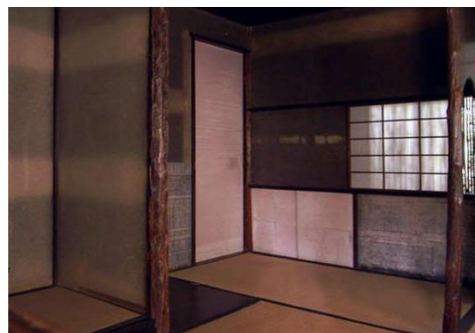
Joan Tea House in Uraku-en Garden (Inuyama)