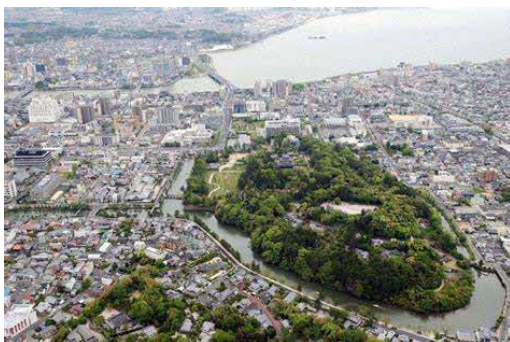
Matsue Castle, Bird's eye View